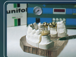
Cold resins and composites